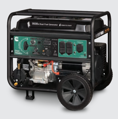
*The P9500df Transfer Switch is NOT CSA certified and is not compliant for use in Canada

At 98 lbs, and with a telescopic handle and wheels, it's lighter and easier to manage